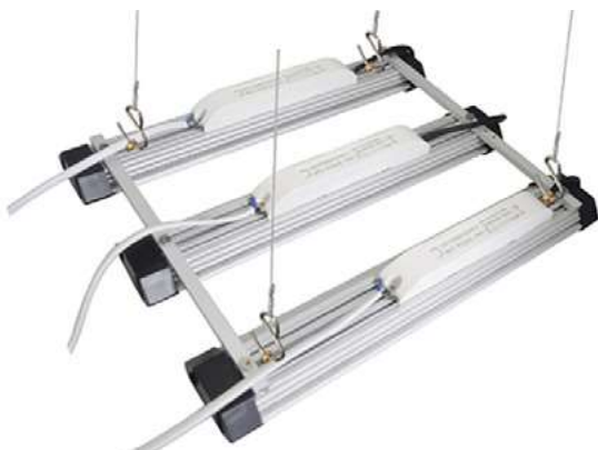
3 Bar Fitting