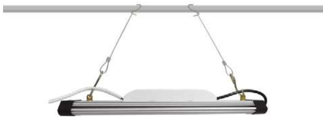
Suspension Cables (included)