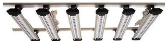
6 bar Fitting